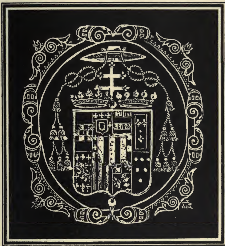
HARLAY DE CHANVALLON, ARCHBISHOP OF PARIS.